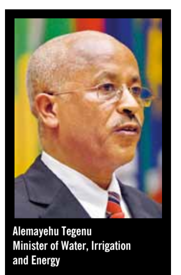
Alemayehu Tegenu Minister of Water, Irrigation and Energy

"It will help to structure and solidify the vision of what the future of Ethiopia should be. Investors can see our list of projects, our financial requirements and how to implement them and I believe that 'seeing is believing.' We want the global investor to be witness for this plan and they can see what is