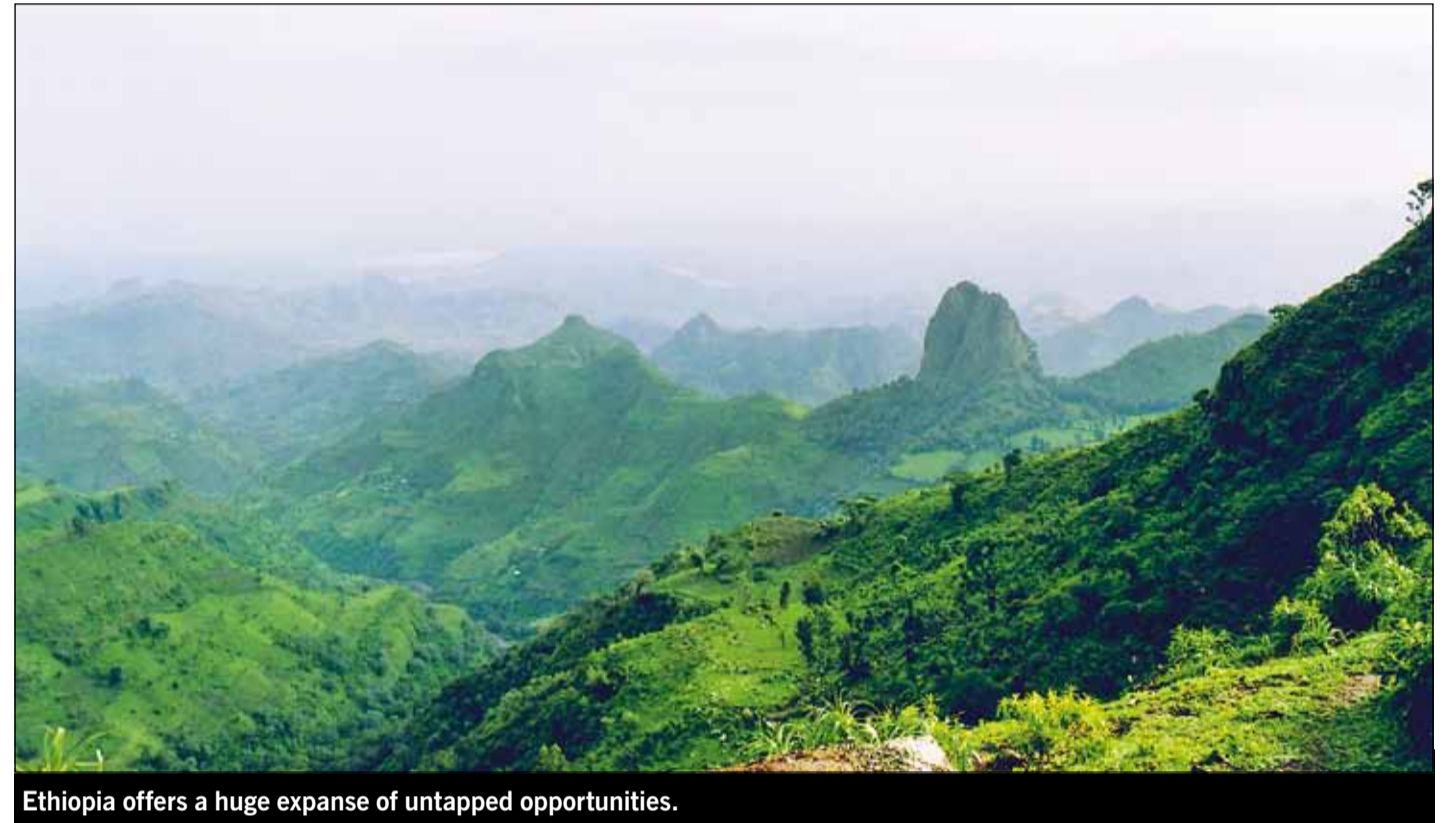
Ethiopia offers a huge expanse of untapped opportunities.

"Our prediction for the current Ethiopian fiscal year is for the country to register an 11.3 percent growth rate. We are relying on agriculture, coffee production, the manufacturing sector and the cut-flower industry. We as a government are com-