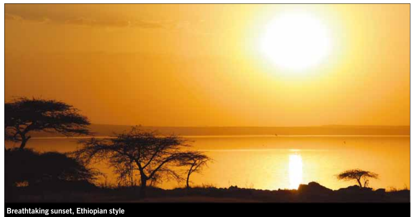
Breathtaking sunset, Ethiopian style

Kaleb boasts excellent workshops, storage and training facilities that enable it to render comprehensive support services to its clients and is also a renowned exporter of seeds, organic sesame, coffee and pineapple.