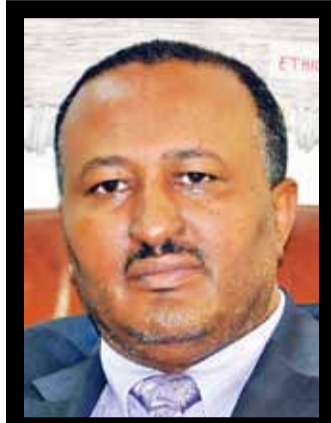
Ahmed Abtew Minister of Industry

also on board. The government funds a minimum of 25 percent of each project and the rest comes from our partners, either through Public-Private Partnerships or aid.