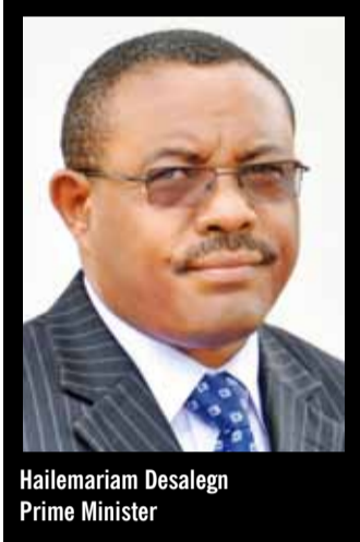
Hailemariam Desalegn Prime Minister

To those over 40 years old, Ethiopia's image is often blighted by the heartrending scenes of starving adults and children affected by drought and famine broadcast around the world during the mid-1980s. Ethiopia it seemed, was on its knees. Today, however, despite still-high levels of poverty, the country is buzzing with change and transformation,