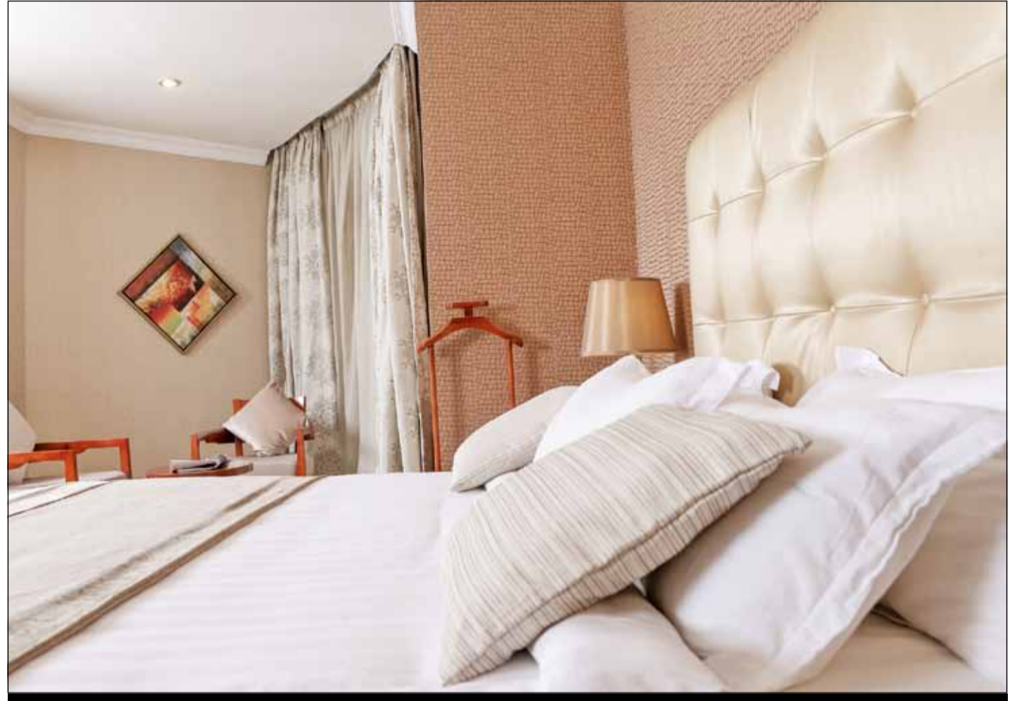
The business traveler’s choice in Addis Ababa

“Japan is a huge market that we are looking to penetrate so we are creating a product that the