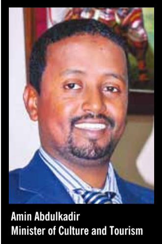
Amin Abdulkadir Minister of Culture and Tourism

With this in mind, the ministry has announced its plans to turn Ethiopia into one of the top-five destinations in Africa by