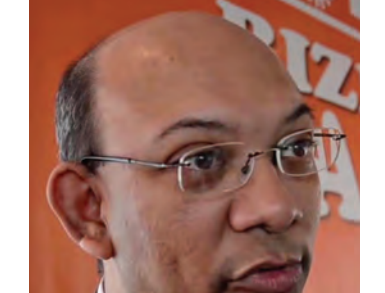
Etienne Sinatambou Minister of ICT

The sector has experienced rapid and sustained growth in recent years and as evidenced by the increasing number of foreign