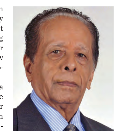
Anerood Jugnauth Prime Minister

The country of 1.2 million people is ranked first in Africa for ease of doing business, competitiveness, economic freedom