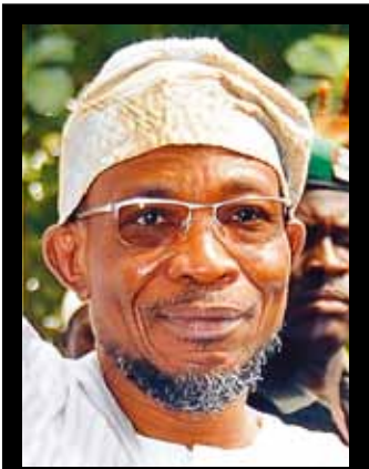
Ogbeni Rauf Aregbesola Governor of the State of Osun

The area enjoys water resources from the Osun River and is a pivotal part of Nigeria's ongoing diversification plan to redistribute petrodollars. More than 75 percent of the State of Osun's inhabitants are farmers, so agribusiness provides