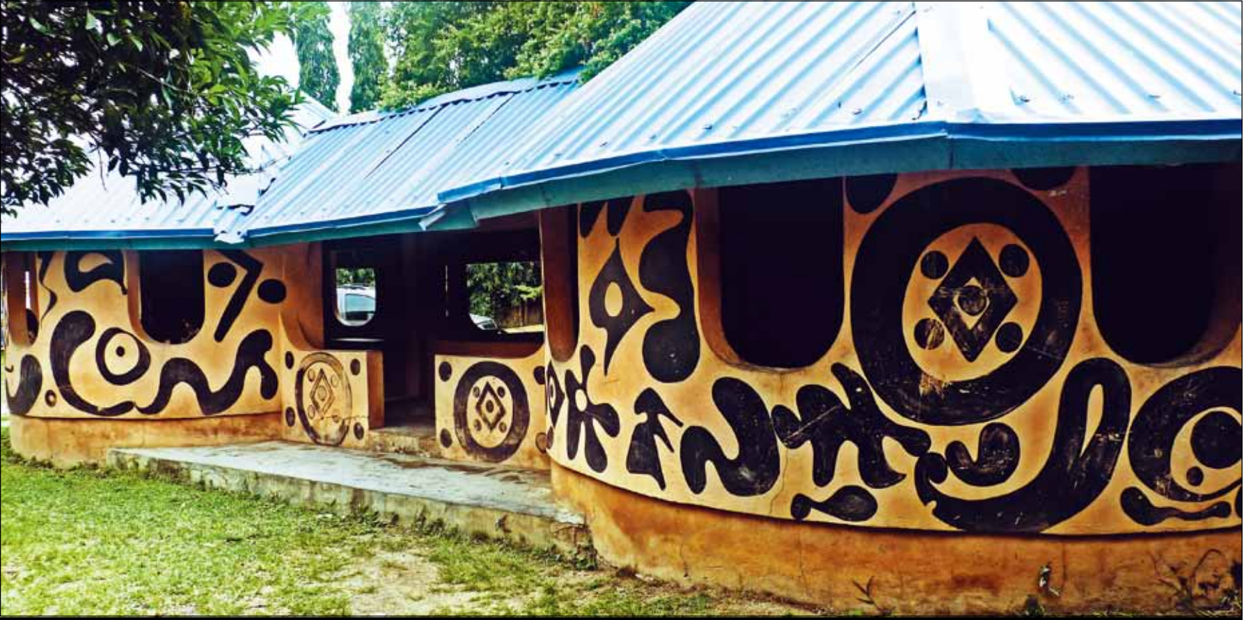
Nike Art Gallery, Osogbo, State of Osun