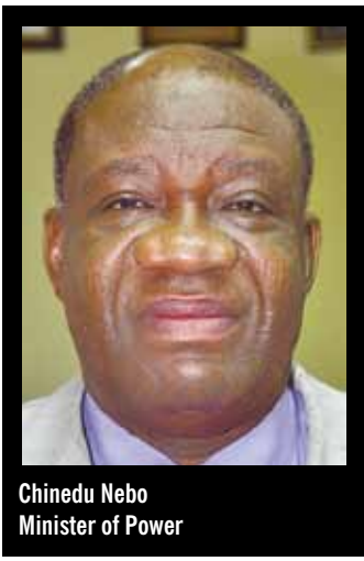
Chinedu Nebo Minister of Power

Omotowa highlighted Japan's 4 percent share in the major new