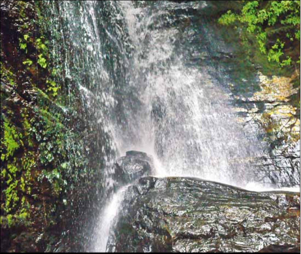
The Olumirin Waterfalls in Erin-Ijesha, State of Osun