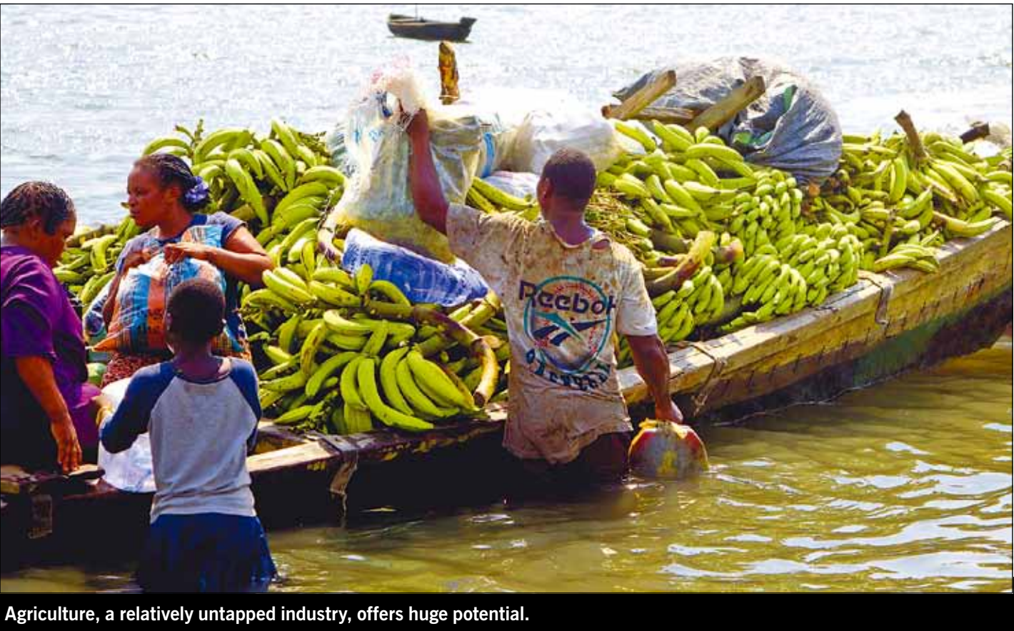
Agriculture, a relatively untapped industry, offers huge potential.