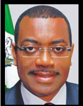
Akinwumi Adesina, Minister of Agriculture and Rural Development

With pro-business President Goodluck Jonathan at the helm since 2011, a strategic socio-economic development blueprint titled the Transformation Agenda has been laid down, which comprises a comprehensive set of priority policies