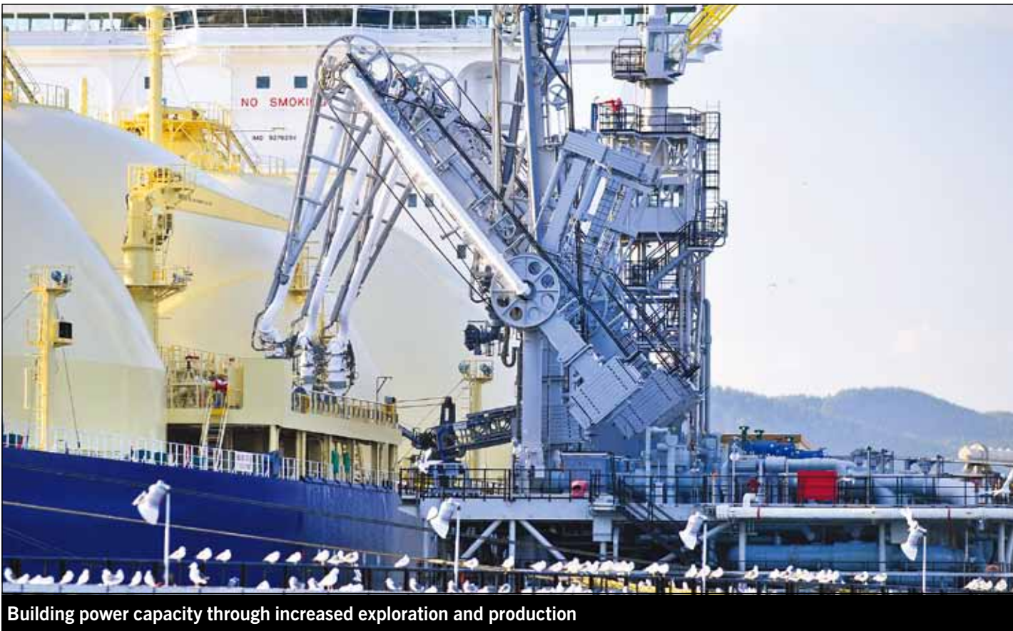
Building power capacity through increased exploration and production

With around 70 employees, Midwestern operates one marginal field in Nigeria and currently averages around 12,000-15,000 barrels of oil per day. The company, which provides health and education services, and